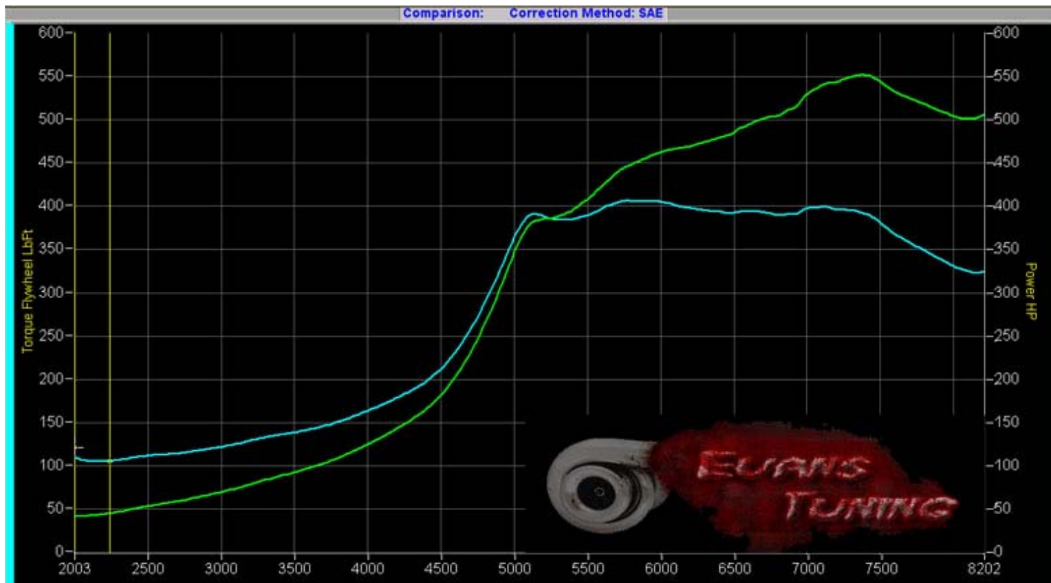
Figure 4. GT30R @ 24 psi with race gas blend fuel.