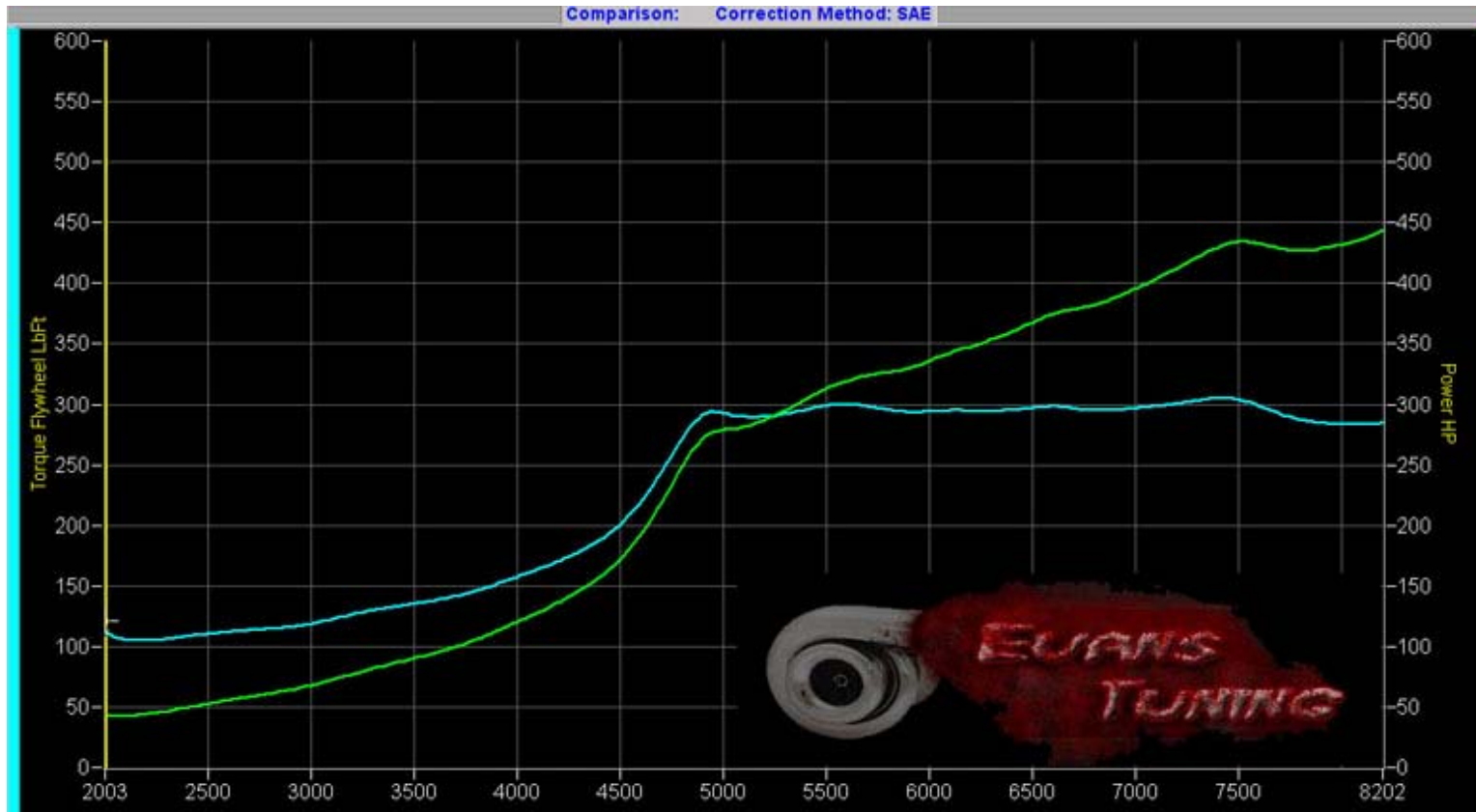
Figure 3. GT30R turbo @ 15 psi with pump gas.