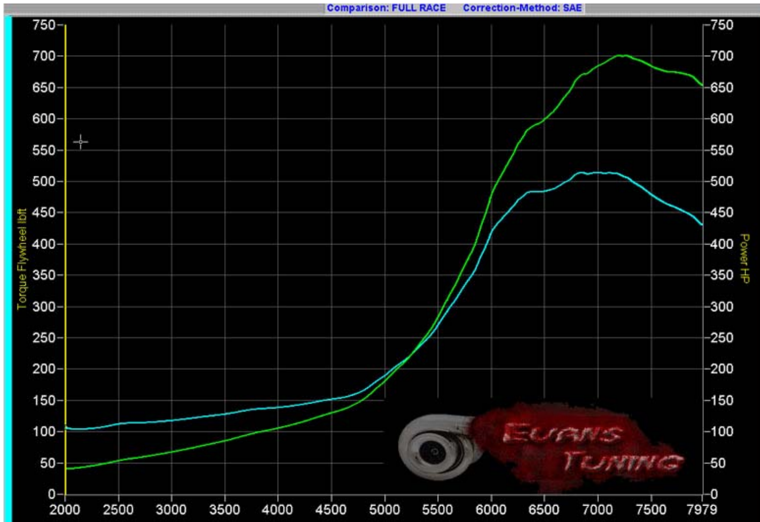
Figure 1. GT40R turbo @ 38psi with race gas blend fuel.