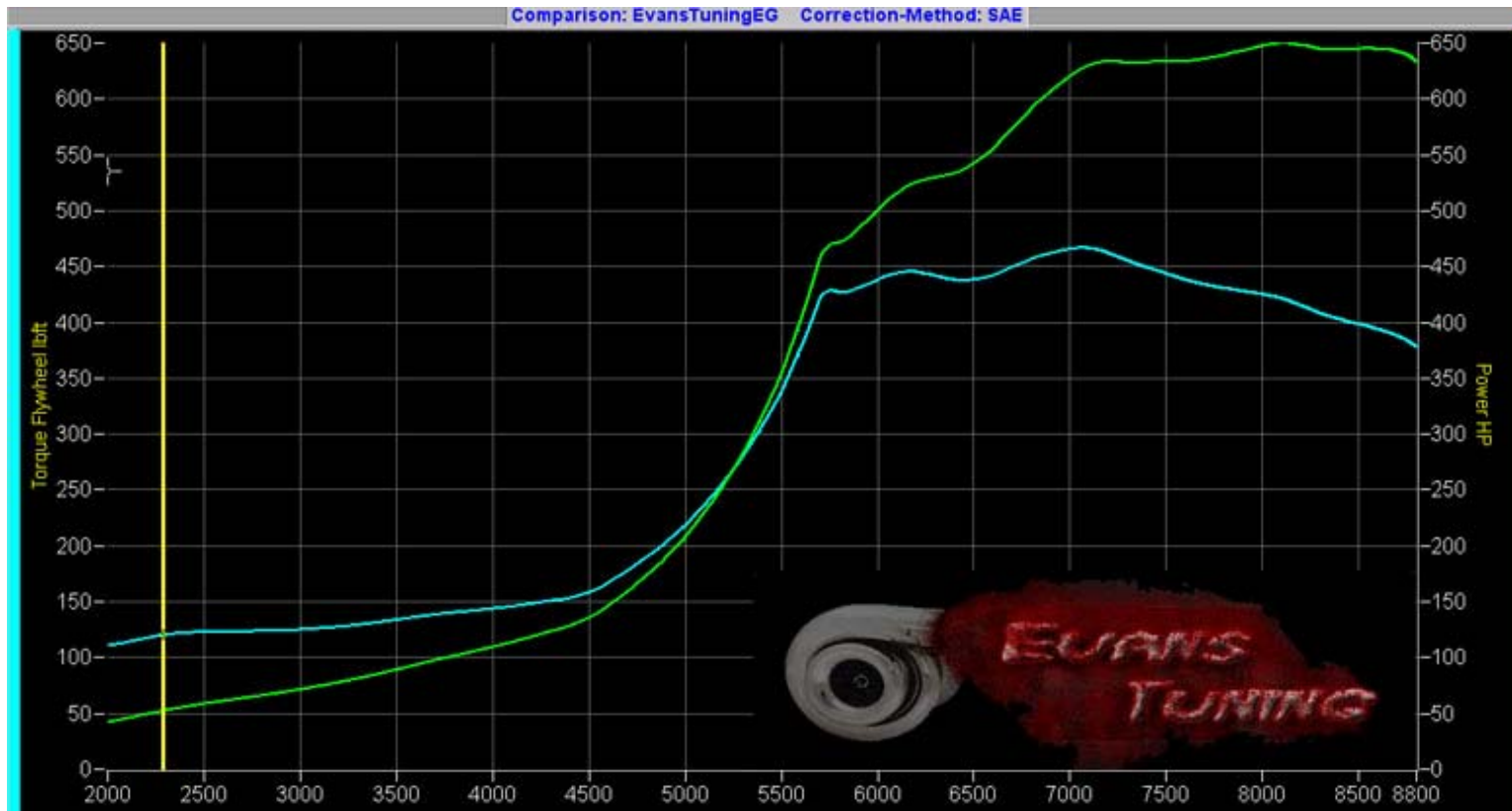
Figure 2. GT35R turbo @ 28psi with race gas blend fuel.