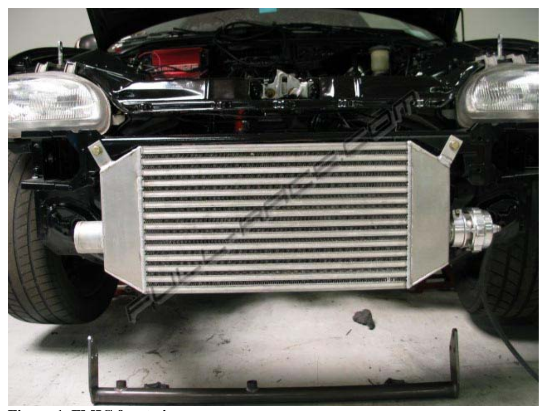
Figure 1. FMIC front view.

Please feel free to contact us regarding any additional questions you may have. We can be reached toll free at 866.FullRace or via email at <a href="tech@full-race.com">tech@full-race.com</a>.