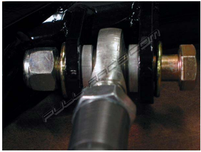
Figure 5. Assembled radius rod fastened to cross member.