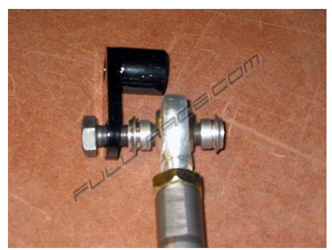
Figure 1. Lower control arm bracket exploded view.