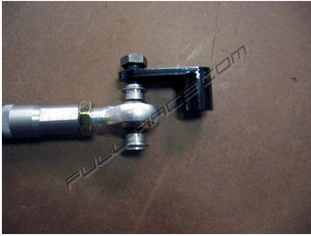
Figure 2. Lower control arm bracket exploded view.