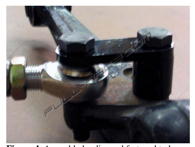
Figure 4. Assembled radius rod fastened to lower control arm.