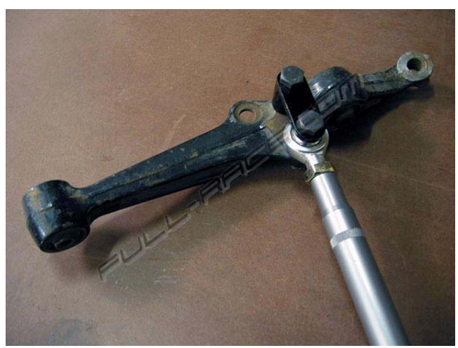
Figure 3. Assembled radius rod fastened to lower control arm.