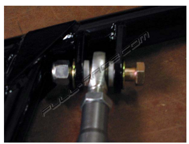
Figure 7. Assembled radius rod fastened to cross member.