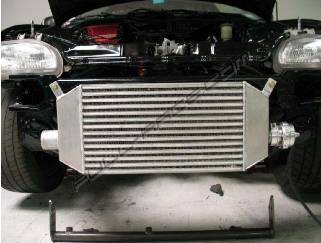
Figure 1. FMIC front view.

Please feel free to contact us regarding any additional questions you may have. We can be reached toll free at 866.FullRace or via email at tech@full-race.com .