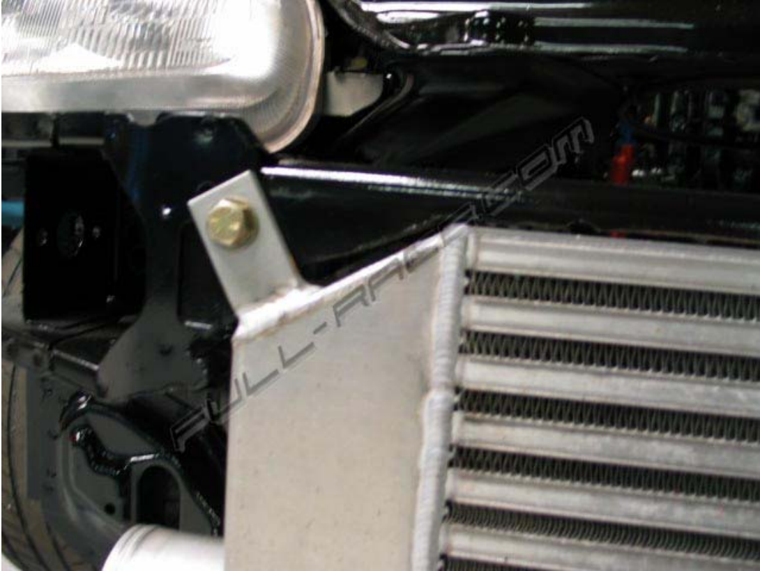
Figure 2. FMIC passenger side tab.