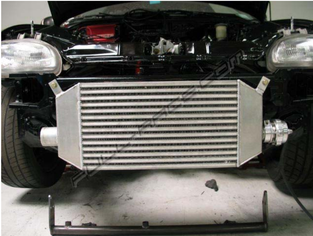
Figure 1. FMIC front view.

Please feel free to contact us regarding any additional questions you may have. We can be reached toll free at 866.FullRace or via email at tech@full-race.com .